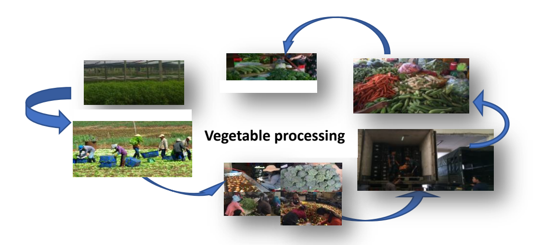
Fig. 2. Common vegetable supply chain at cooperatives

In the common supply chain, there is a lack of linkage in actors' activities and there is no main actor to maintain the linkages in the chain sustainably. The linkage in the chain is weak at all stages: