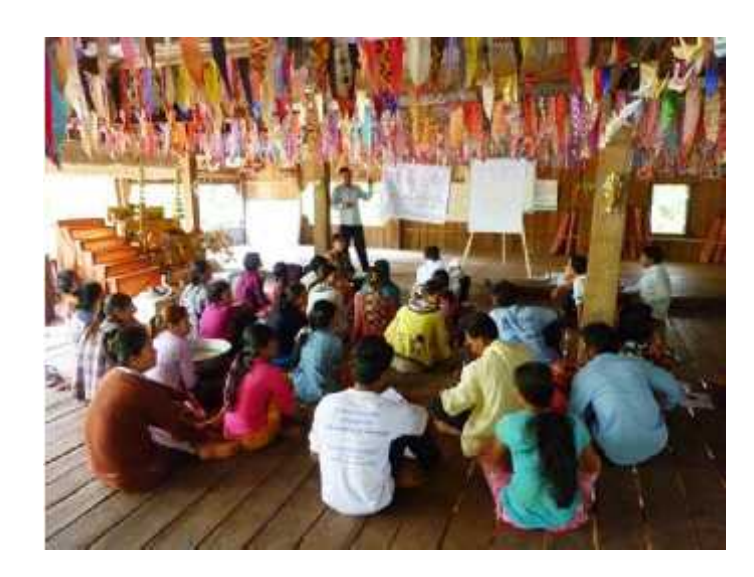
Trainings of farmers