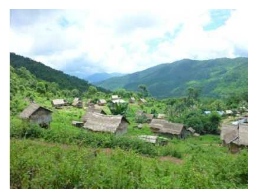
Laos Sayabouri Province Xienghone & Hongsa Districts