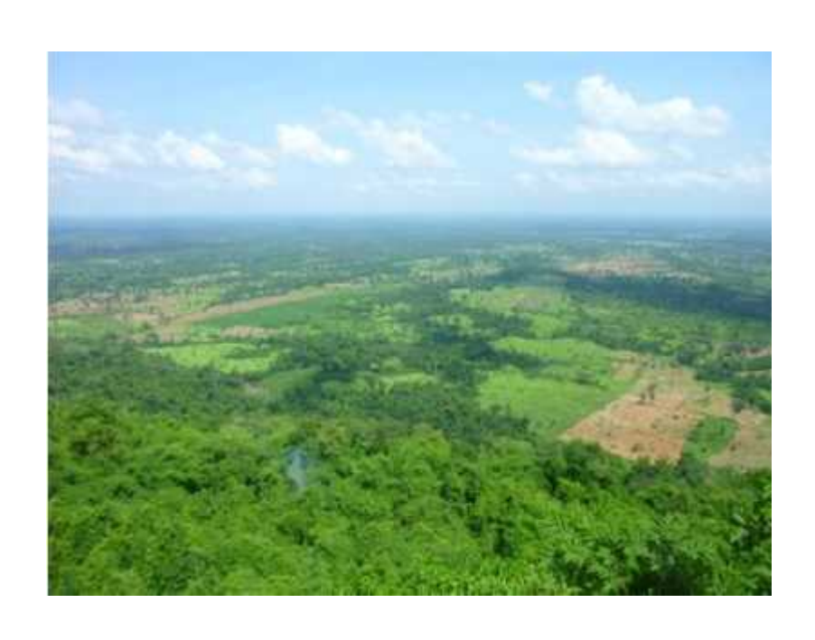
Cambodia Oddar Meanchey Province Anlong Veng & Trapeang Prasat Districts