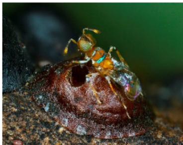
Diversinervus sp. , a parasitoid of Saissetia hemispherica on custard apple

Agro-ecological crop protection (ACP) is an innovative, ordered approach that stems directly from applying the principles of agro-ecology to crop protection, in which ecological aspects are truly centre-stage. ACP aims to reconcile efficient crop protection against pests and diseases with the socioeconomic, ecological, environmental and sanitary sustainability of agro-ecosystems. It is also intended to make a substantial contribution to the switch from agrochemical-based practices to agro-ecological practices within cropping systems.