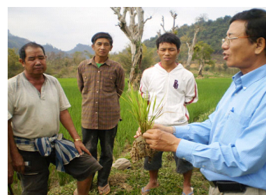
Intensive Training on SRI