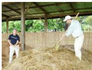
Compost making practice