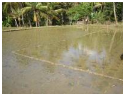
Rake Marker (Indonesia)