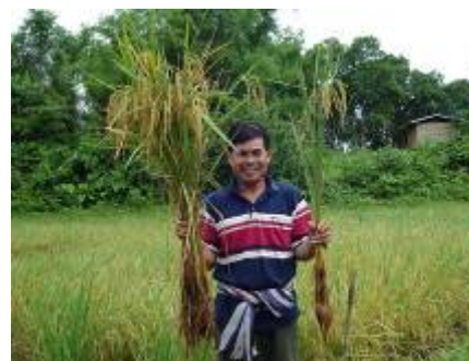
SRI Paddy (left) vs. Non SRI Paddy (right)

The SRI concept is nowadays applying to other crops (wheat, sugarcane, millet). SRI is in progress by evolving and ramifying.