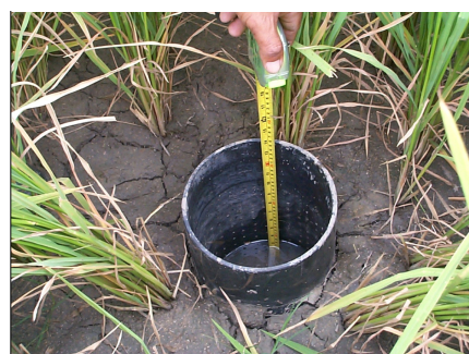
Observation well in a paddy lot

To ensure that the rice plant is not stressed, the level of the water table should not go below 15 cm from ground surface. Installation of a simple observation well (10-12 cm dia., 50 cm long PVC pipe) at the corner of paddy lot is recommended to determine when to irrigate again.