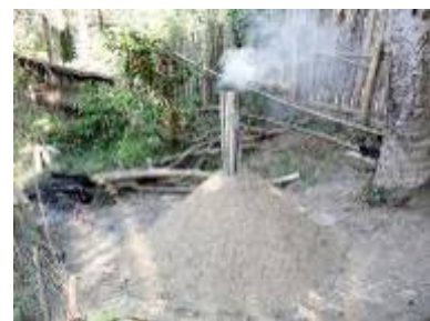
Charcoaled rice husk making