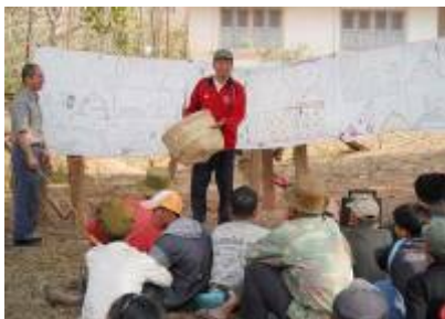
Farmer training for compost making

Quality of compost to be purchased should be checked carefully.