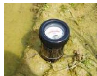
pH Meter to check soil condition

Some social and political conditions may cause difficulty for sustainable SRI practices. They are: