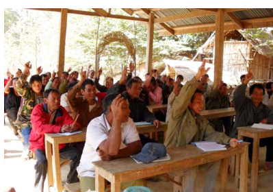
General Guidance on SRI