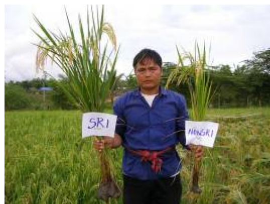
SRI plant (left) has more tiller & bigger root