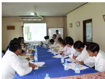
SRI Guidance to Extension Workers